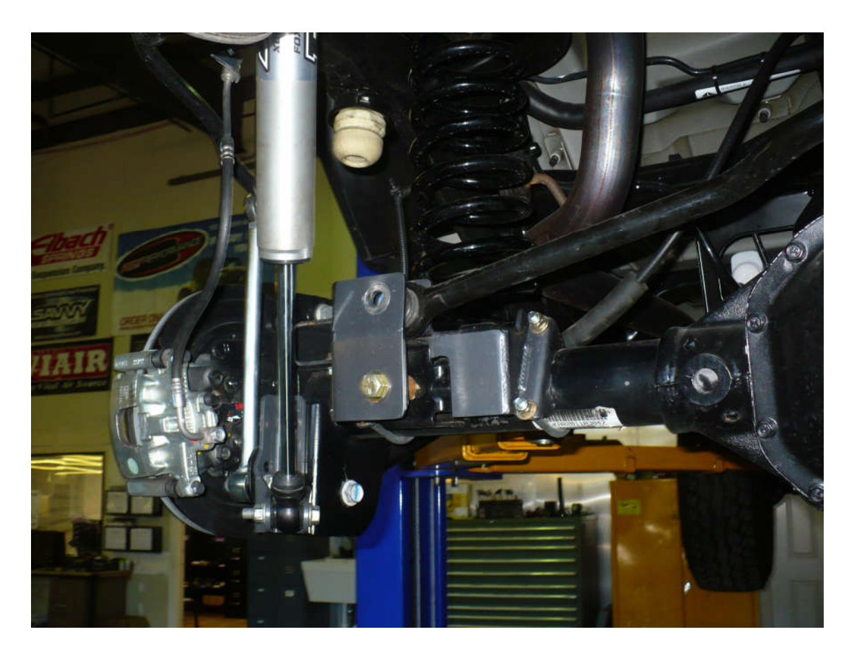
INSTALLATION IS COMPLETE